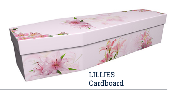
Stock Designs available from £597.00