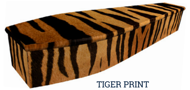
Stock Designs available from £642.00