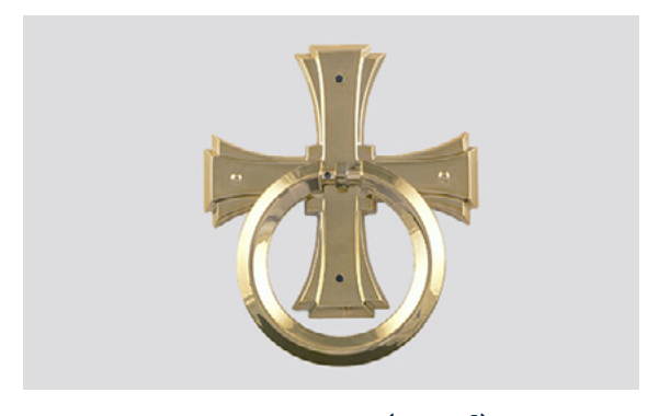
HANDLE VIII (Metal)