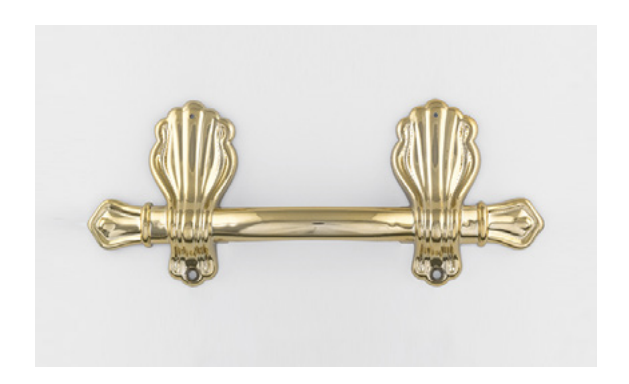
HANDLE VII (Metal)