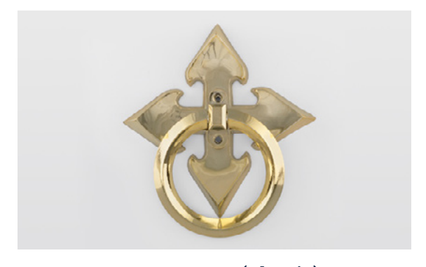
SAXON RING (Plastic)