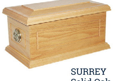
Solid Oak £102.00