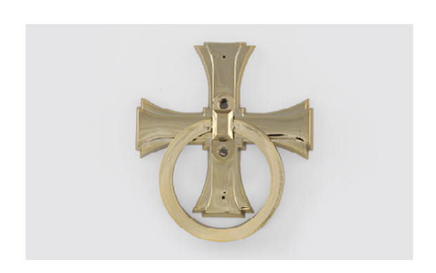
HANDLE IV (Plastic)