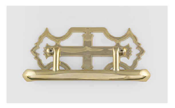
HANDLE I (Plastic)