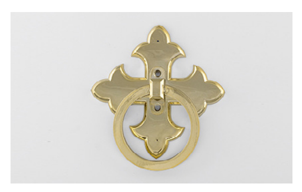
HANDLE III (Plastic)