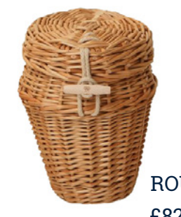
ROUND WILLOW £82.00